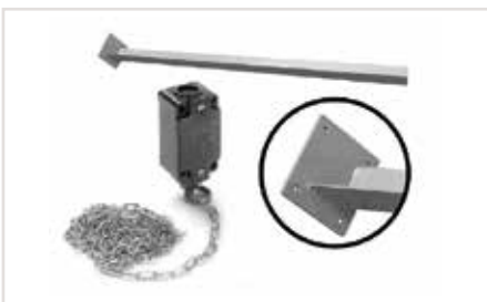
Chain switch and chain support rod