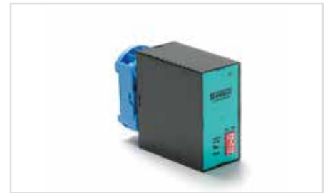
Single coil metal detector