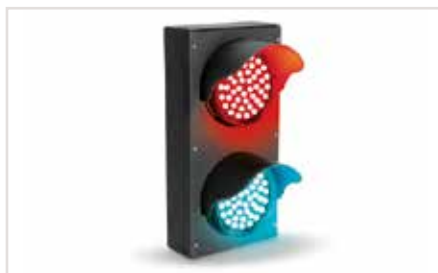
Traffic light with 2 lights complete with control unit