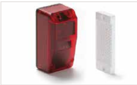
Reflection photocells with polarised light, with polarising mirror, range 12m