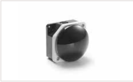
Palm button for door opening command