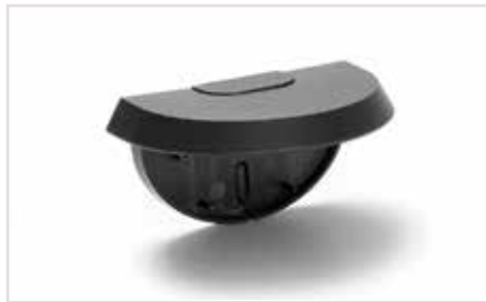
Weatherproof radar hood and mounting bracket