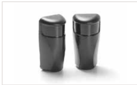
Pair of infra-red photocells (can also be used as an opening command)