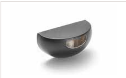
Microwave detector radar, IP 54