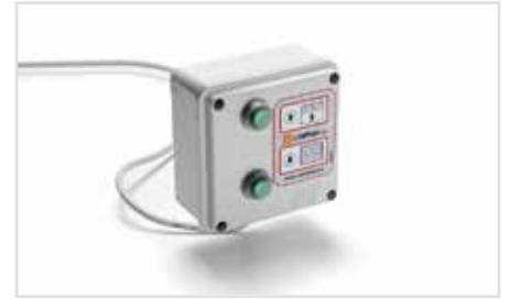
Push-button panel with two keys